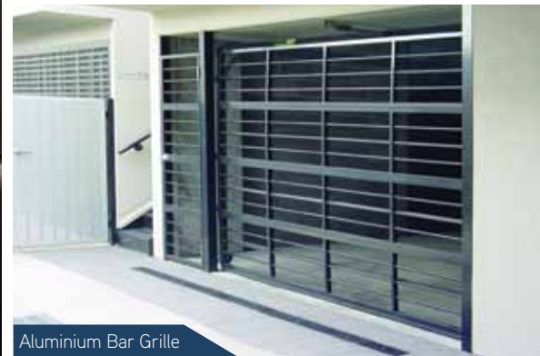
Aluminium Bar Grille

For superior quality, strength and security in commercial, retail and industrial applications, nothing fits the mould better than our aluminium sectional doors.