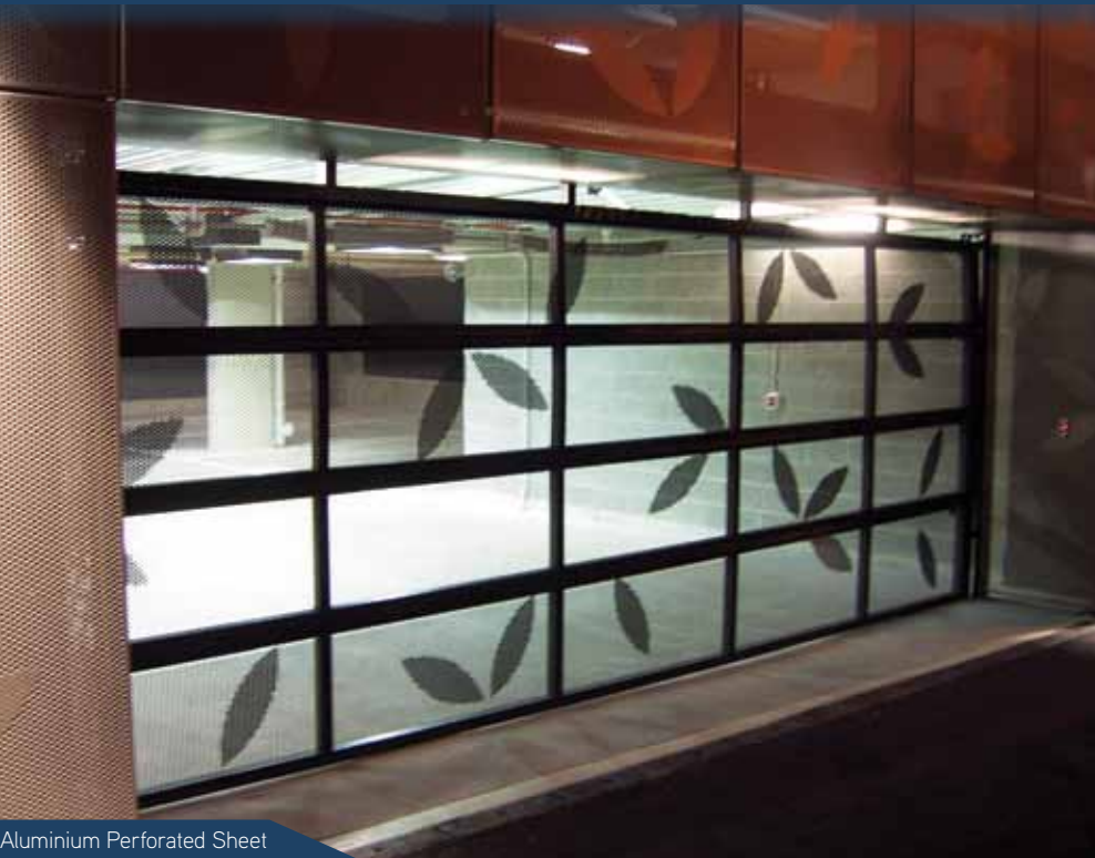
Aluminium Perforated Sheet

WIDE RANGE OF CLADDING AND GLAZING OPTIONS